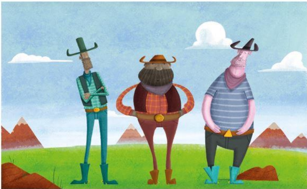
A group of cowboys

Cowboys were needed to move the cattle from one place to another. This could take months, so the cowboys lived and worked together and became friends.