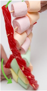
Sweets or fruit