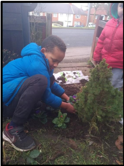
Great gardening skills!

Here are some home learning photos from this week: