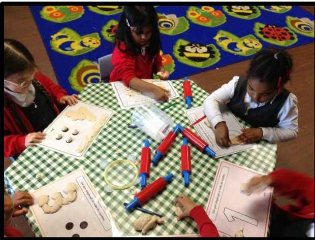
Left: Children in Reception using playdoh to learn how to count and recognise numbers. Right: Year 5 children taking part in some exciting drama based on the book they are reading.