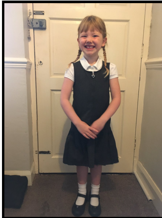
One little girl was very happy & excited to be back at school! She has had a brilliant week!